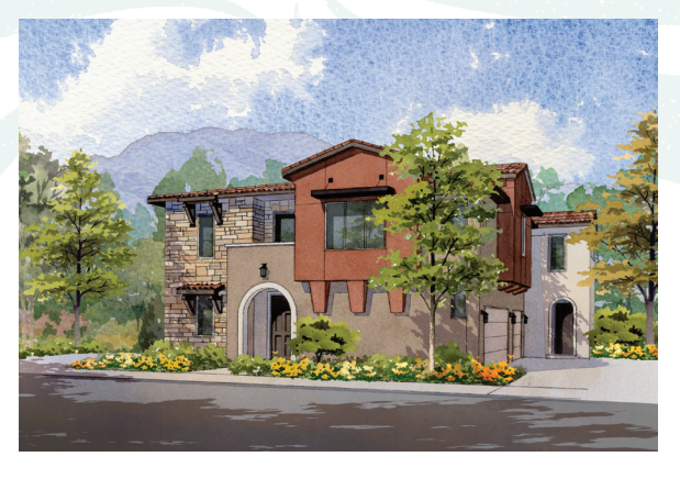
BUILDING TYPE 400A