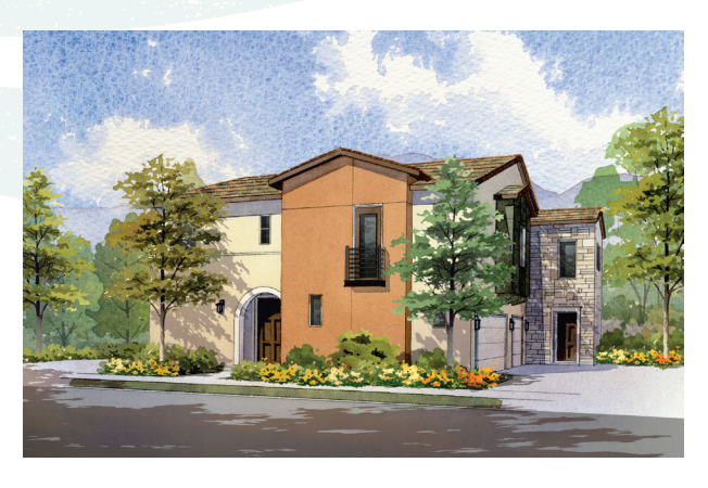
BUILDING TYPE 400B