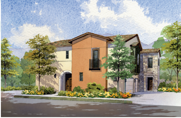
BUILDING TYPE 400B