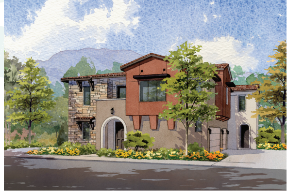
BUILDING TYPE 400A