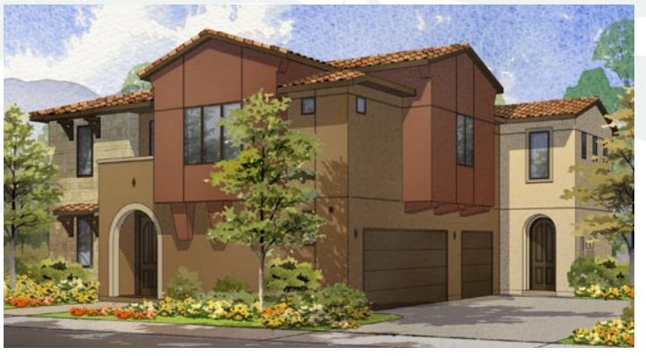
BUILDING TYPE 400A