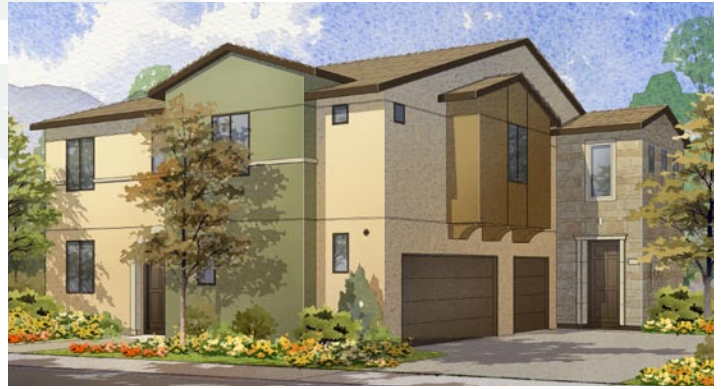
BUILDING TYPE 400B