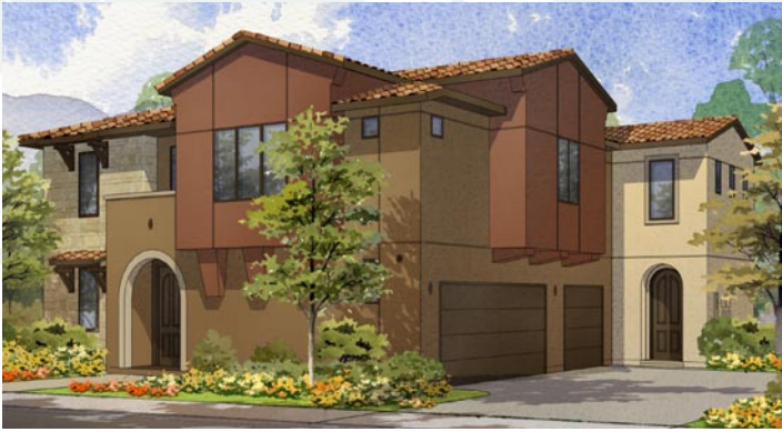
BUILDING TYPE 400A